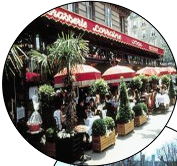
PLACE DES TERNES : RESTAURANTS TAXI. TEN MINUTES