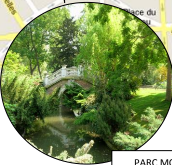
PARC MONCEAU 5 MINUTES