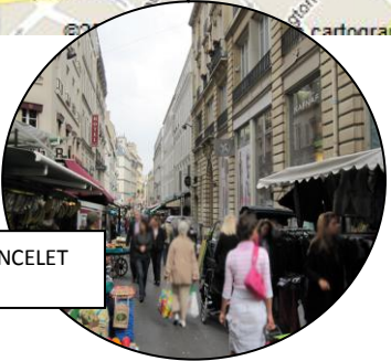
MARCKET PONCELET 10 MINUTES