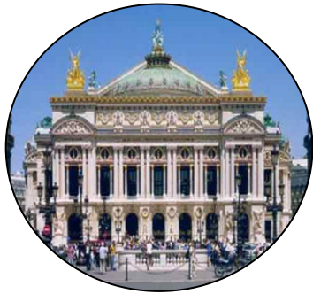
TO GO TO : OPERA. PRINTEMPS. GALERIE LAFAYETTE : FIVE STATION DIRECT 10 MINUTES