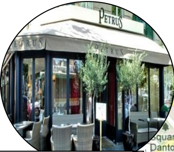
PLACE PEREIRE: RESTAURANTS AND TAXI. FIVE MINUTES